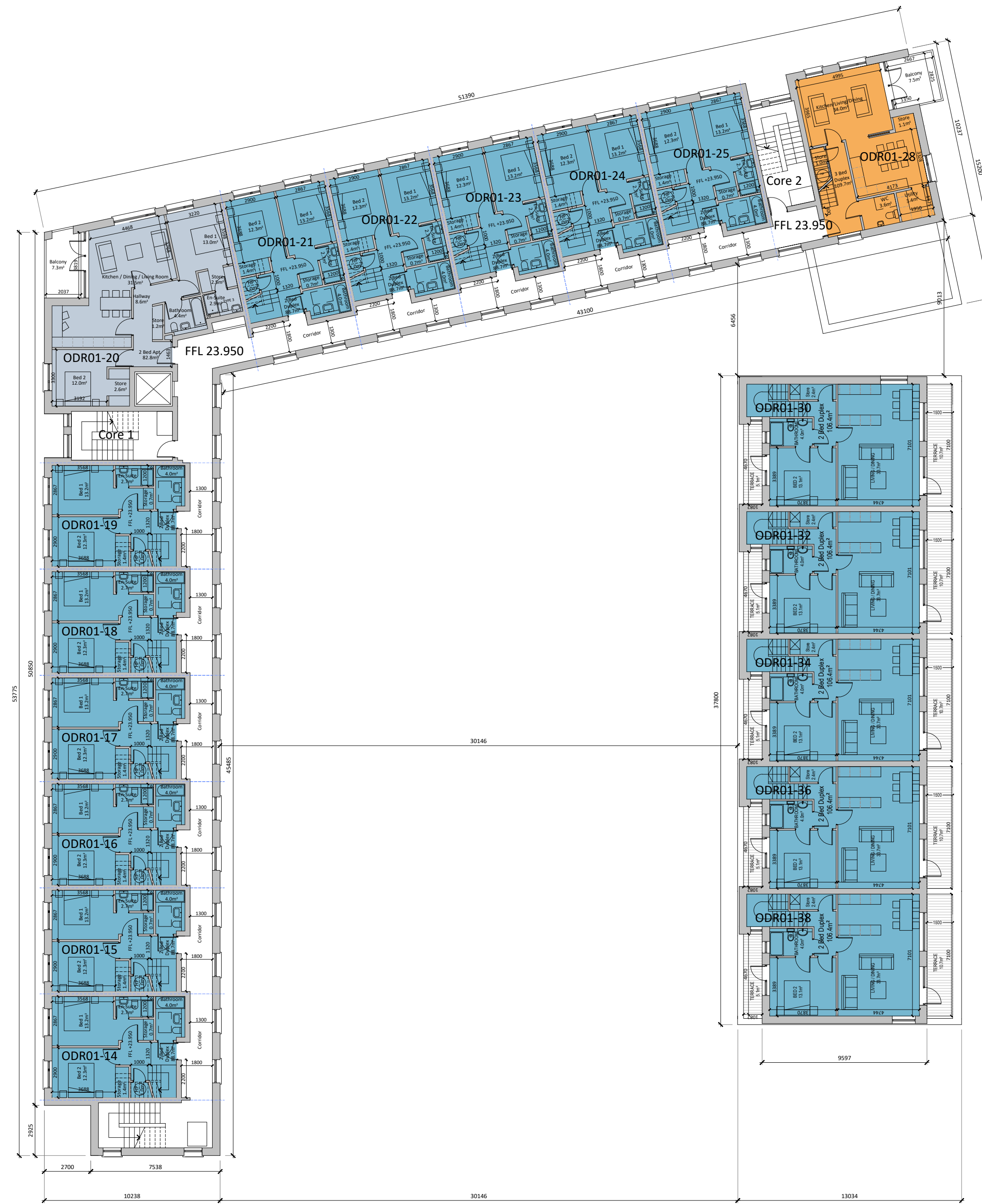
ODR Level 02