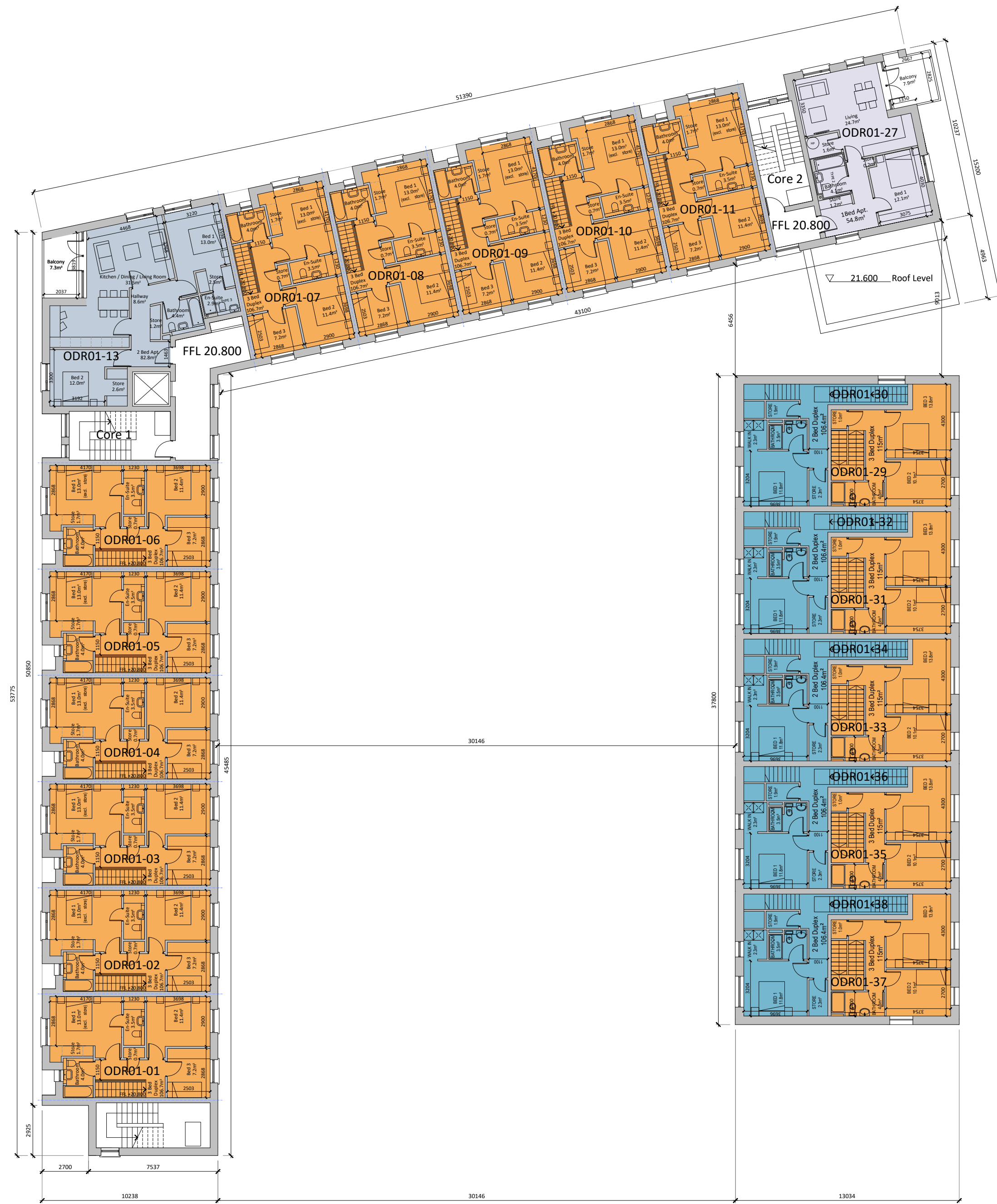
ODR Level 01